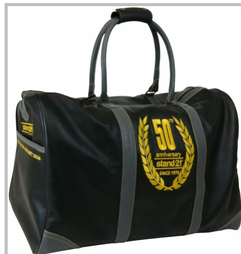
Stand 21 50th Anniversary travel bag

The profits from this product's sale will benefit the " Racing Goes Safer " Foundation for motorsport safety.